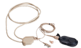
Wireless Completely Discreet Kit

"When I first saw the MOTOTRBO SL Series I thought that it was a cell phone, not an actual two-way radio. It has all the capabilities of a two-way radio but with a professional, discreet look that fits absolutely well with all our uniforms."