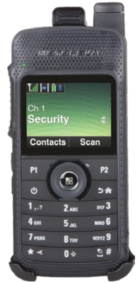
SL 7590 (900 MHz) SL Series Radio in Carry Holster Radio shown in "face out" position

The SL Series is backed by a two-year Standard Warranty (US and Canada) with a minimum one-year warranty on Motorola-branded accessories. Because accidents happen, Motorola recommends Service from the Start Comprehensive, which delivers accelerated turnaround on radio repairs (including physical, chemical and liquid damage) and even covers shipping costs. By reducing your downtime, Service from the Start Comprehensive helps you to lower your total cost of ownership and focus on your business operations, not your technology.