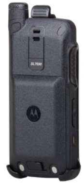
Carry Holster Radio shown in "face in" position

Our unique multi-unit charger merges high power with high image, too. You can charge six radios simultaneously and recharge a battery in the top slot whenever a radio is removed. This charger is both functional and sleek in design.